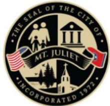
Exhibit B - PUD Amendment