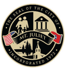
Exhibit A- Future Land Use Amendment