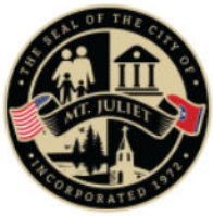
Exhibit B Annexation / Plan of Services