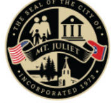
Exhibit B- Annexation