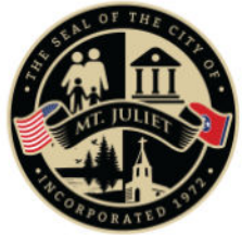
Exhibit B - Annexation