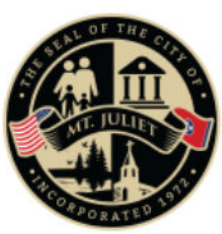
Exhibit A- LUA